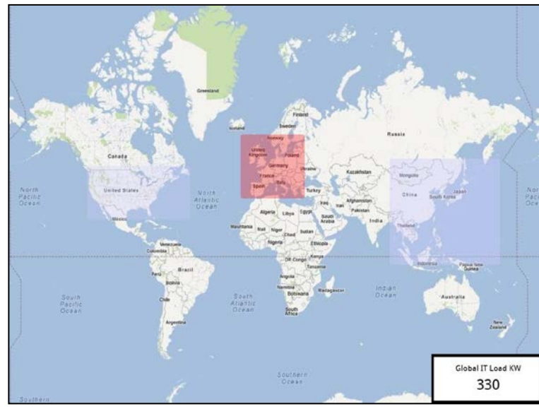
Fig 2. HTML5 Dashboard in Options NOC showing Global View with UK Fault

In addition to the rack PDUs, the sites contained a number of UPS, chillers and AHUs (Air Handling Units) which needed to be monitored. Furthermore, Options wanted to monitor its sites’ PUE values. All the devices supported SNMP.