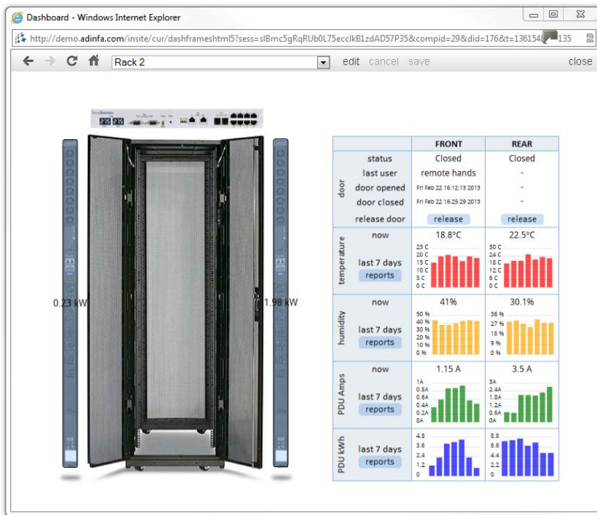
Fig 3. HTML5 Dashboard from Insite Demonstration site showing example Rack

“We have improved the monitoring of our power estate, ... reduced PUE and seen a return on our investment within 6 months”