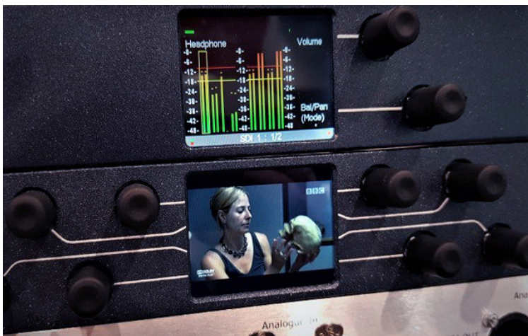
MPA1 Solo and Mix SDI

“ When we started designing our newest OB truck, we were looking for the smallest form audio monitoring unit we could find, that would be flexible and easy to use for our VT operators, and the new MPA1 Solo SDI was just the ticket, ”