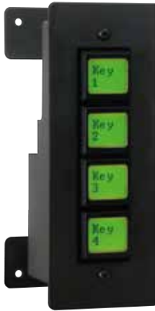
EB4X-DBB Mount Right side