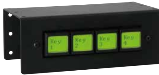
EB4X-DBB Mount Top Horizontal