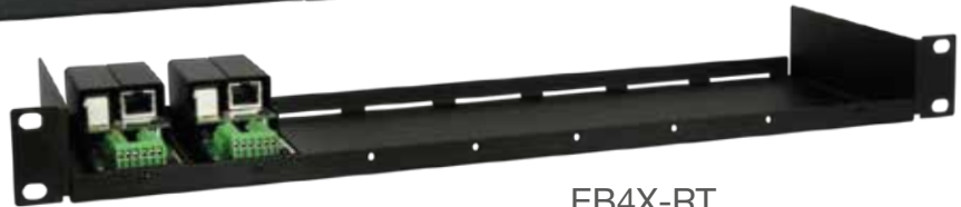
EB4X-RT 1-RU Rackmount Panel, Holds 8 EG-4