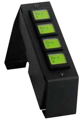
EB4X-DTB Desktop Mount