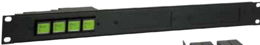
EB4X-RP 1-RU Rackmount Panel, Holds 3 IP Control Buddies